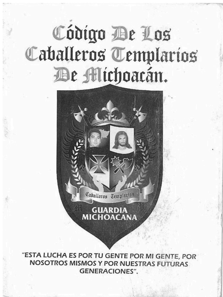
Image 5.1: Cover page 'Code of The Knights Templar of Michoacán', own scan. The quote reads: 'This fight is for your people for my people, for ourselves and for our future generations'

Chapter 1) might seem justified at first sight. The more so when it comes to Mexican organized crime and not least its Michoacán variant. After all, those leading a group now claiming to constitute a force of good were amongst the protagonists that pushed the phenomenon into its oppressive, hyperviolent form emblemizing a new dimension of social disorder in the region.