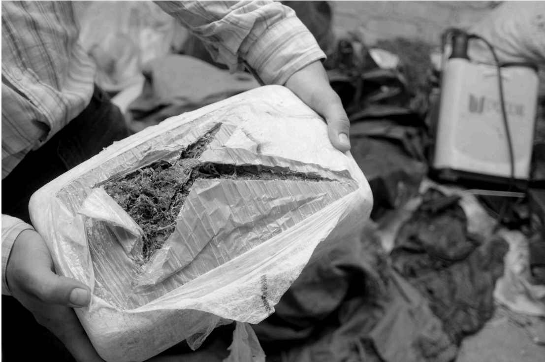
Image 4.3: Marihuana harvested and pressed into kilo bricks for shipment, Tierra Caliente, Michoacán, 2011.