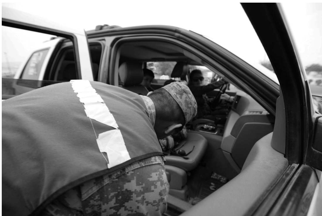
Image 6.1: Search at military checkpoint, Tierra Caliente, Michoacán, 2015.