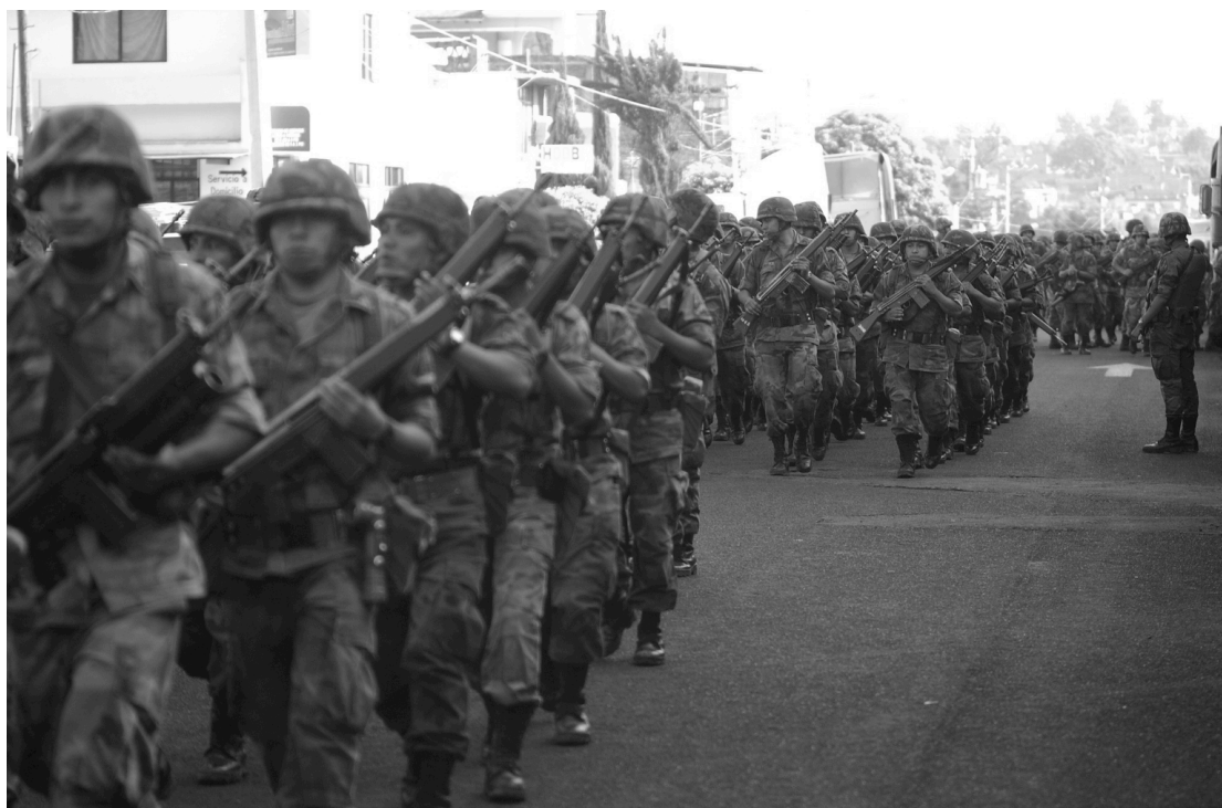
Image 6.2: Military deployment in Tierra Caliente, Michoacán, 2006.

Deviating from the main routes and pushing deeper into Tierra Caliente via its smaller capillaries, smaller overland and ultimately dirt roads, we entered a zone of transition. On the road that led us away from Apatzingán and towards our meeting with El Inge in the deserted, dusty countryside surrounding the city, we wound our way through military and navy checkpoints. Just five miles on, we encountered their shadowy reflections. First, halcones appeared on the side of the road. The entrance to the village itself, the indicated meeting point, was guarded by two men who I had already spotted as our vehicle approached. Both in their early twenties, their kit consisted of baseball caps, sunglasses, AR 15 rifles, 9mm handguns, and joints. They inhaled deeply from the latter as they verified that we were indeed expected. Before letting us through, there was time for small talk and I was asked to say something in German. ‘I see, so this is what German sounds like. Okay then, they’re waiting for you already...’ We were told to await further instructions at a close-by house. Here, a sicario ’s mother provided us with the anecdotes corresponding to