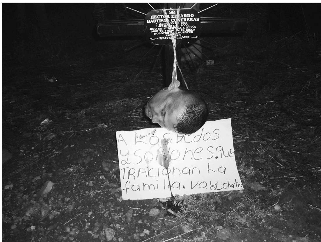
Image 4.1: Murder as text in El Aguaje, Tierra Caliente, Michoacán, 2009.

mutating. To the outside world, most of this meaning is lost as selected images become channeled into and blurred to indistinction in the sea of violent imagery that provides reporting on (and imaginations of) Mexico's 'drug-fueled conflict' with its visual backdrop.