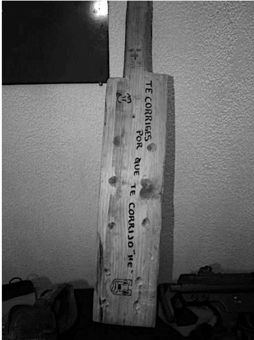
Image 5.3: Paddle used for corporal punishment.