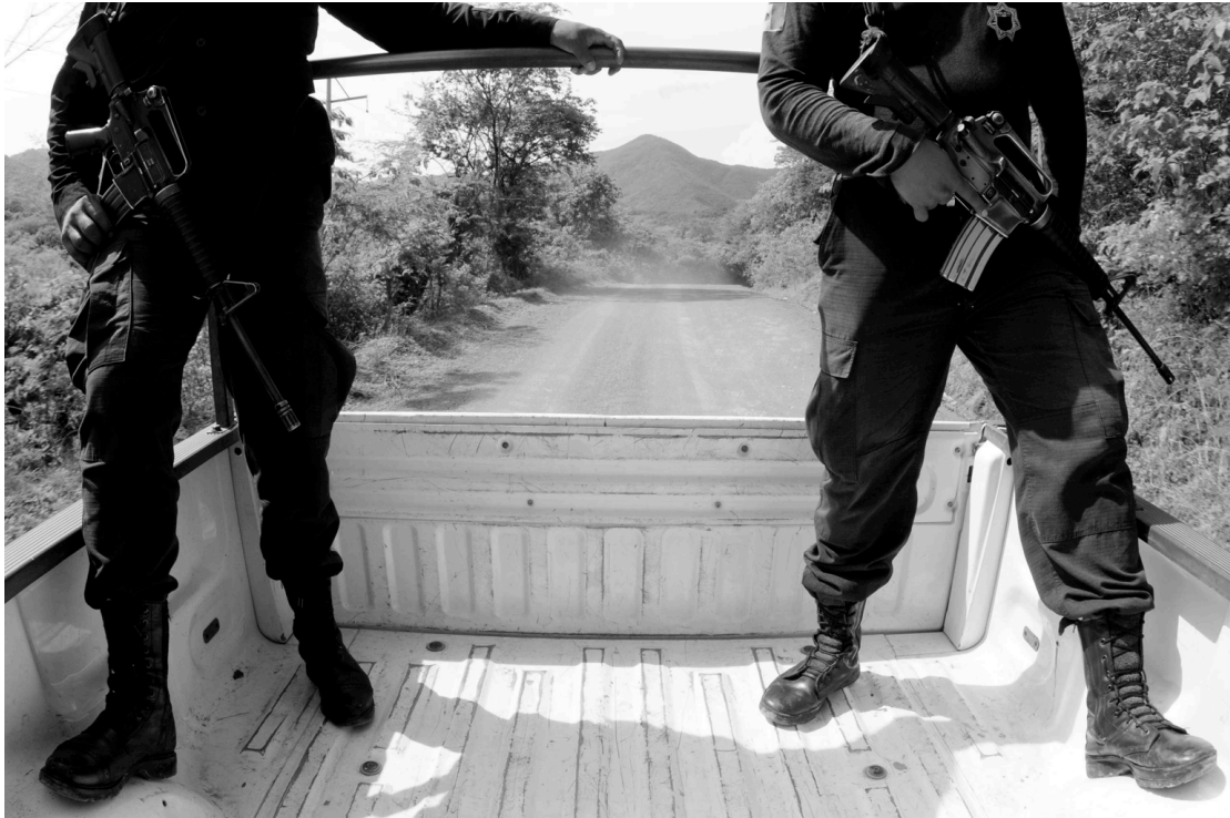
Image 6.4: Rogue state fragments, Tierra Caliente, Michoacán, 2011.

instance, assassinations of those opposing its claim of regional supremacy were ordered by Moreno and carried out by state officials. In a similar vein, individuals were apprehended and handed over to LCT by 'state officials', including Michoacán's specialized anti-kidnapping unit. The violent capacity of the state turned to an alternative use.