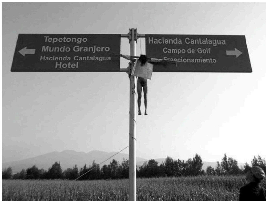
Image 5.4: Murder as text for 'non-market-related purposes', Michoacán, 2012.