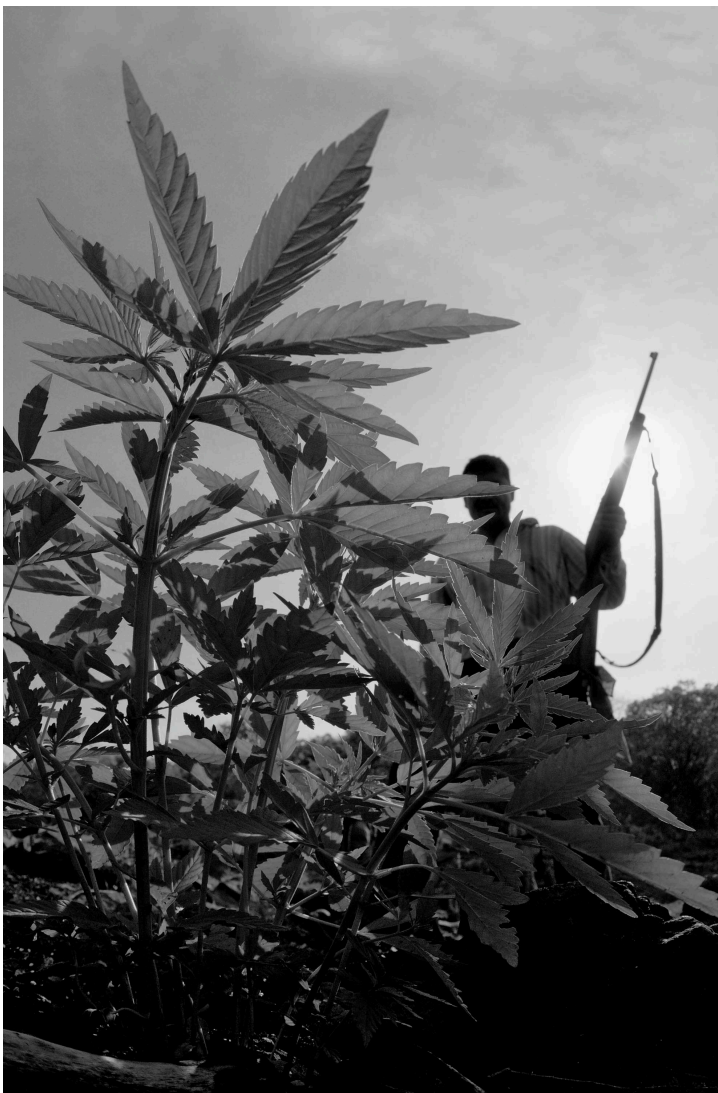
Image 4.2: Peasant on Marihuana plantation in Tierra Caliente, Michoacán, 2011.

using a hydraulic press 31 to make very compact packs... so they would bring it home... and under your bed there would be packs of enervante ... my uncles weren't major producers either, it was more like everybody in the ranchos [small rural settlements] was growing... because it was the way to survive... one would always grow corn for consumption, and beans, some pigs and maybe some cattle... But if you wanted to have a little something extra, you had to grow enervante since that would give you a little more money annually... to buy clothing, shoes, and maybe it would even be enough for a vehicle... and what's more is that growing marihuana isn't difficult, this plant is so noble that you can just put it in the middle of a corn plantation, there it grows strong, big and beautiful plants... and you didn't even have to invest a lot, no fertilizer or anything like that... So everybody went up to el cerro 32 .'